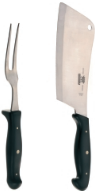
CARVING FORK (15cm / 6" Prongs) 5017