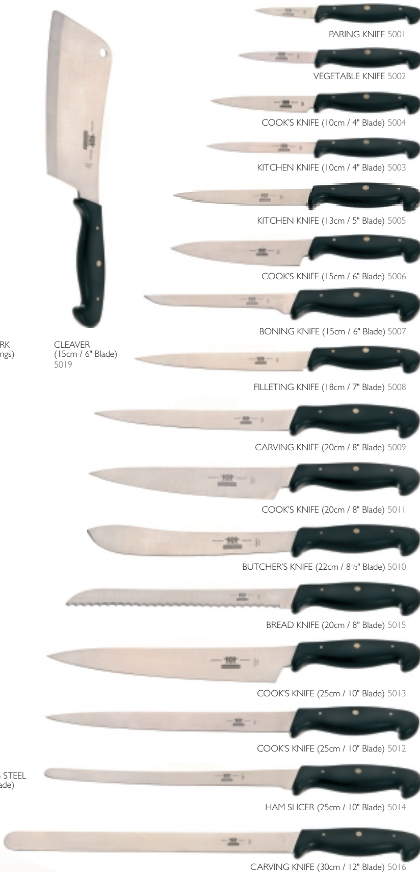
PARING KNIFE 5001